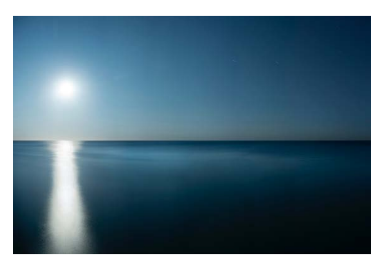
Andre Lichtenberg Indian Summer Memories (Impossible Utopia) 2023

Andre Lichtenberg's large-scale seascapes, Impossible Utopias use the moonlight, the stars and the sea to create long exposure detail photographs, rich in texture and painterly detail. Surreal oceanic scenes that could hold thousands of memories of untold stories, they aim to provide a calming canvas for reflection, "a moment of pause to hopefully inspire and entice debate on important current issues, such as global warming, the oceans, migration, borders, inclusion and sustainability. In his view, everything is connected. The project also hopes to inspire a new relationship with the planet, to promote a more humble view of our world that engenders a caring response to all species and the environment, whilst moving away from the dangerous idea of human exceptionalism.