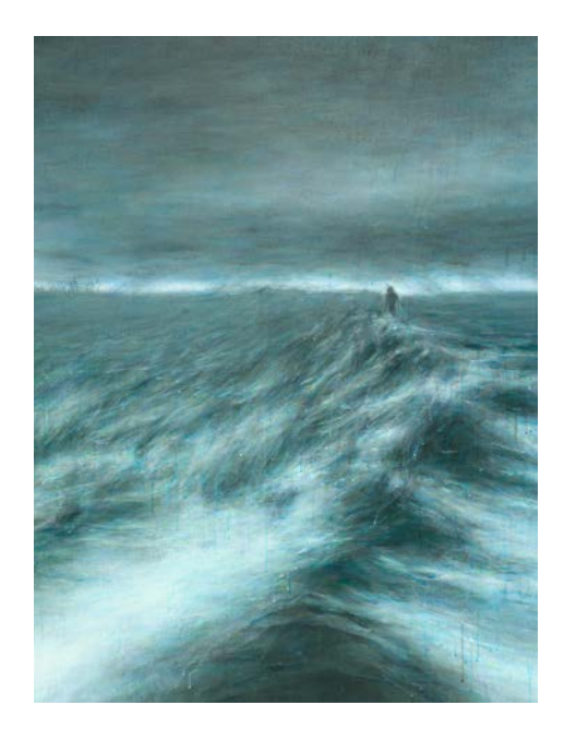
Dee Ferris Love Is The Seventh Wave (detail) 2024

Dee Ferris 's paintings reflect an ongoing enquiry into the languages of desire, longing and nostalgia. Using the sea as a vehicle to explore themes of solitude, displacement and migration, she has previously manipulated the alluring images of escape and the pleasurable pursuit of water-based leisure promoted on online travel and social media platforms, subjecting these to an intense process of dissolution to re-emerge as paradoxical and precipitous visions whose implicit promise of fulfilment is called into question. Her two new large-scale works on canvas, Silver Linings and Love is the Seventh Wave continue to explore the territory between abstraction and figuration, but bring her artistic enquiry closer to home, drawing on the artist's personal experience of living by, and frequently swimming in the sea, and suggest a more intimate and optimistic connection to her source.