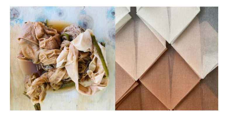
Arantza Vilas Sea water colour study 2020

Arantza Vilas is a textile artist, designer and researcher with an interdisciplinary and experimental studio practice, for whom the long coastal stretch of her adopted home is a place of chance, abundance and possibility, providing tools, processes, form and colour. Her work is deeply invested in process, driven by material investigation and spans multiple disciplines, combining ancient crafts with sustainable methods to innovate, provoke reflection and develop a sense of narrative. The textiles proposed for this exhibition are created in collaboration with the waves as they break into the shore, sourcing fibres that have been developed from seaweed and extracting pigments from foraged seaweed from the beach at Brighton and Hove. They take the form of wall pieces and vessels that explore the limitlessness of the liminal; the area where the sea meets the land is neither one or the other, an in-between, a threshold and a transition from one state into another.