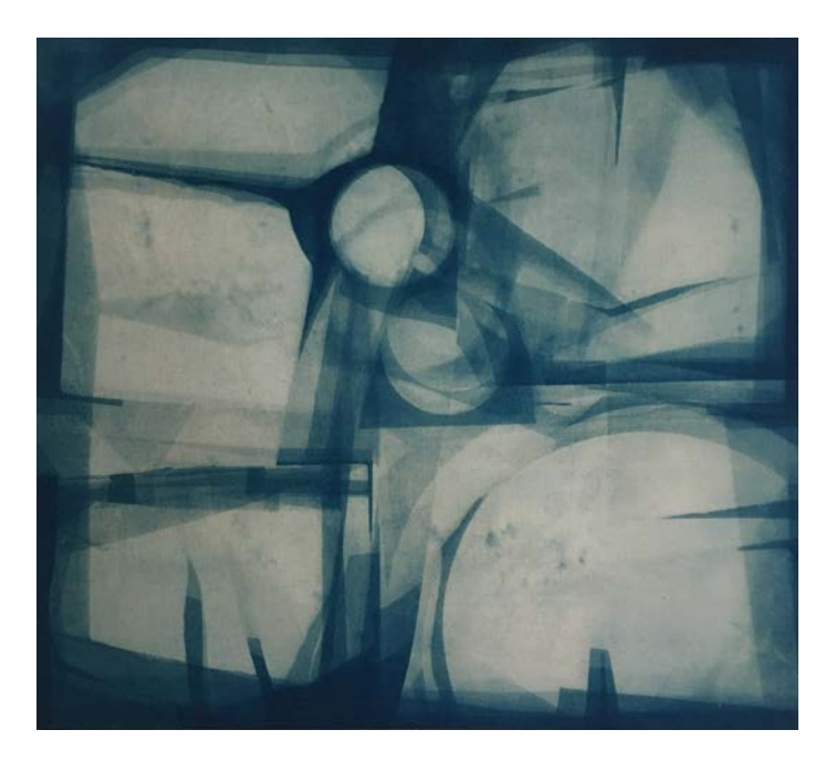
Solange Leon Iriarte Everybody's Twenty One Minutes 2021

Solange Leon 's Bluescapes are cyanotypes/solar etchings born out of an intuitive response to shifting borders in seaside urban enclaves, and a desire to visualise and explore, in an abstract way, concepts of social mobility, equality, interdependence. Reflecting the movement of waves, and in a delight in the unknown, they convey an ethereal and delicate set of complex overlapping shapes with indistinct edges that express the brevity of a moment in permanent form, where merging individual components in flux remain recognisably distinct.