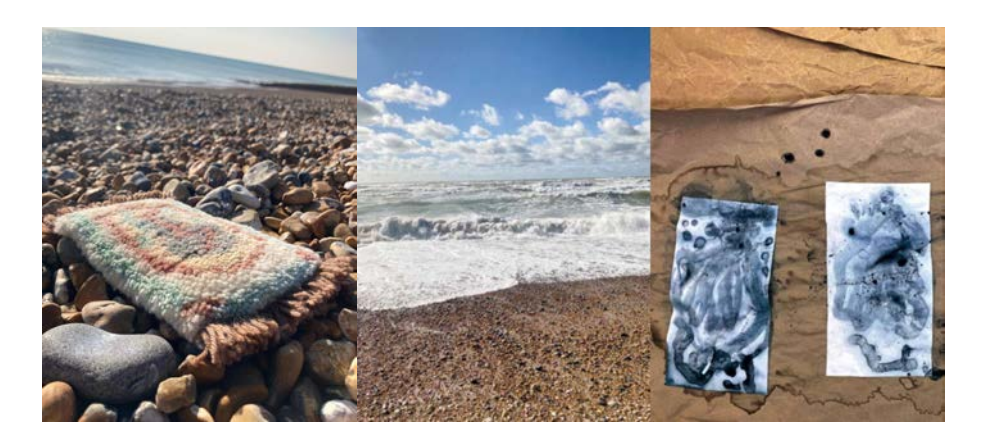
Carole Villain Abstract Alchemy III and Indigo Skin of the Sky, 2023

Carole Villain 's paintings, prints, tapestries and words, explore the multi-dimensionality of experience and reveal connections between beings. Objects, humans, places, and animals; artificial or natural, fictional or real, inner or outer, are all intertwined in structures which are not as solid or rigid as they seem. Her 3D works will be shown here alongside her publication Indigo Skin of the Sky , a booklet formed of two poems, photos of the seaside in Hove and photos taken during the process of making a series of works with paper, agar agar and indigo ink. As she describes it, "What could be child play is alchemy. The wind on the beach, the line of the horizon, and the sound of pebbles on the shore are all involved. They are not external sources of inspiration or imaginary friends, they collide, collaborate and transform to create a new skin. This new skin is like the horizon in the photos or the border between pages; it is fixed and moving at the same time. It is the limit between the sea and the sky, between the inside and the outside."